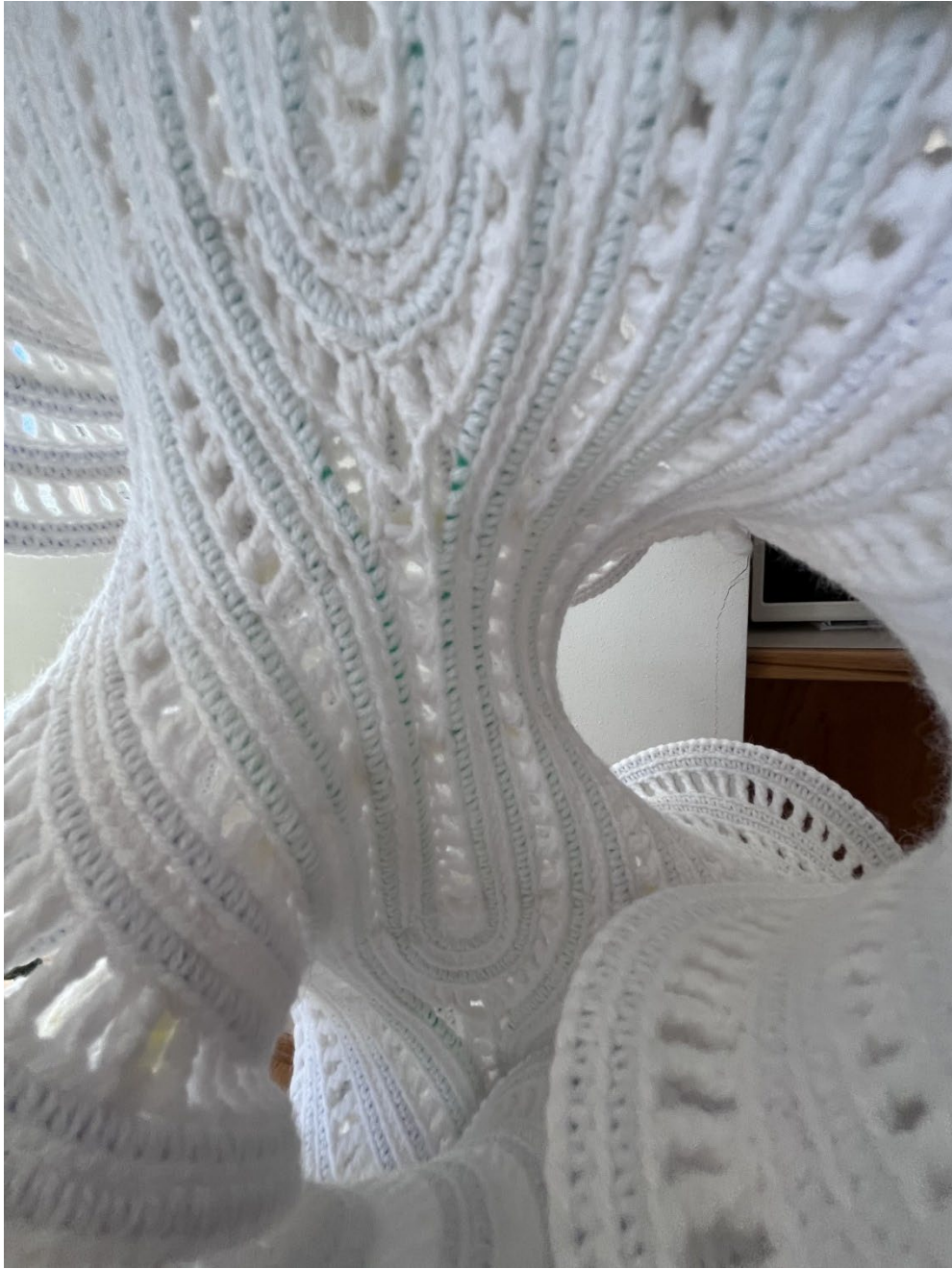
Further detail of hyperbolic triangle