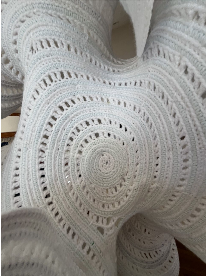
Front central detail of hyperbolic triangle