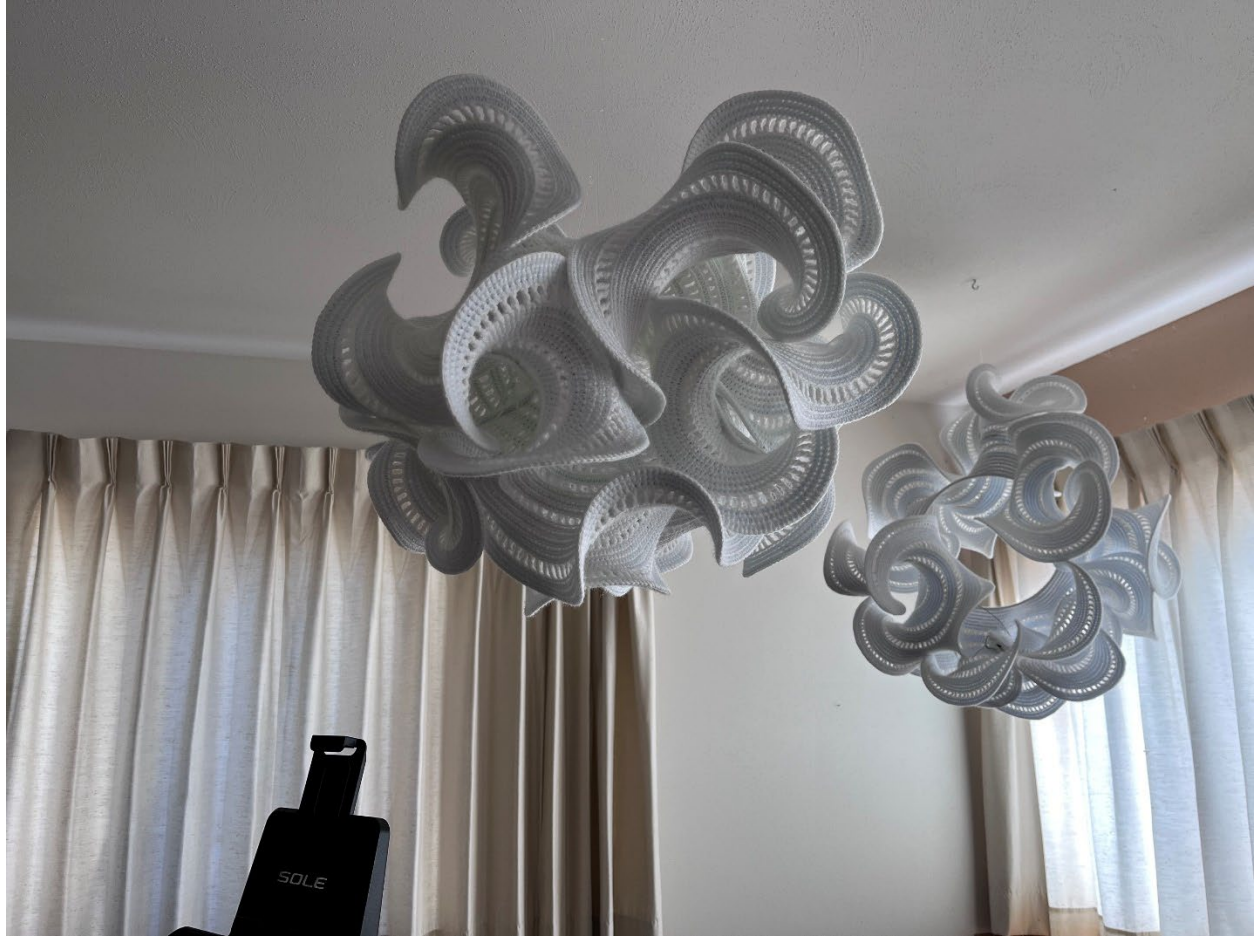
Hyperbolic hemisphere and ring. The hemisphere is a disc with a rib in the back. The ring was crocheted around a metal ring.