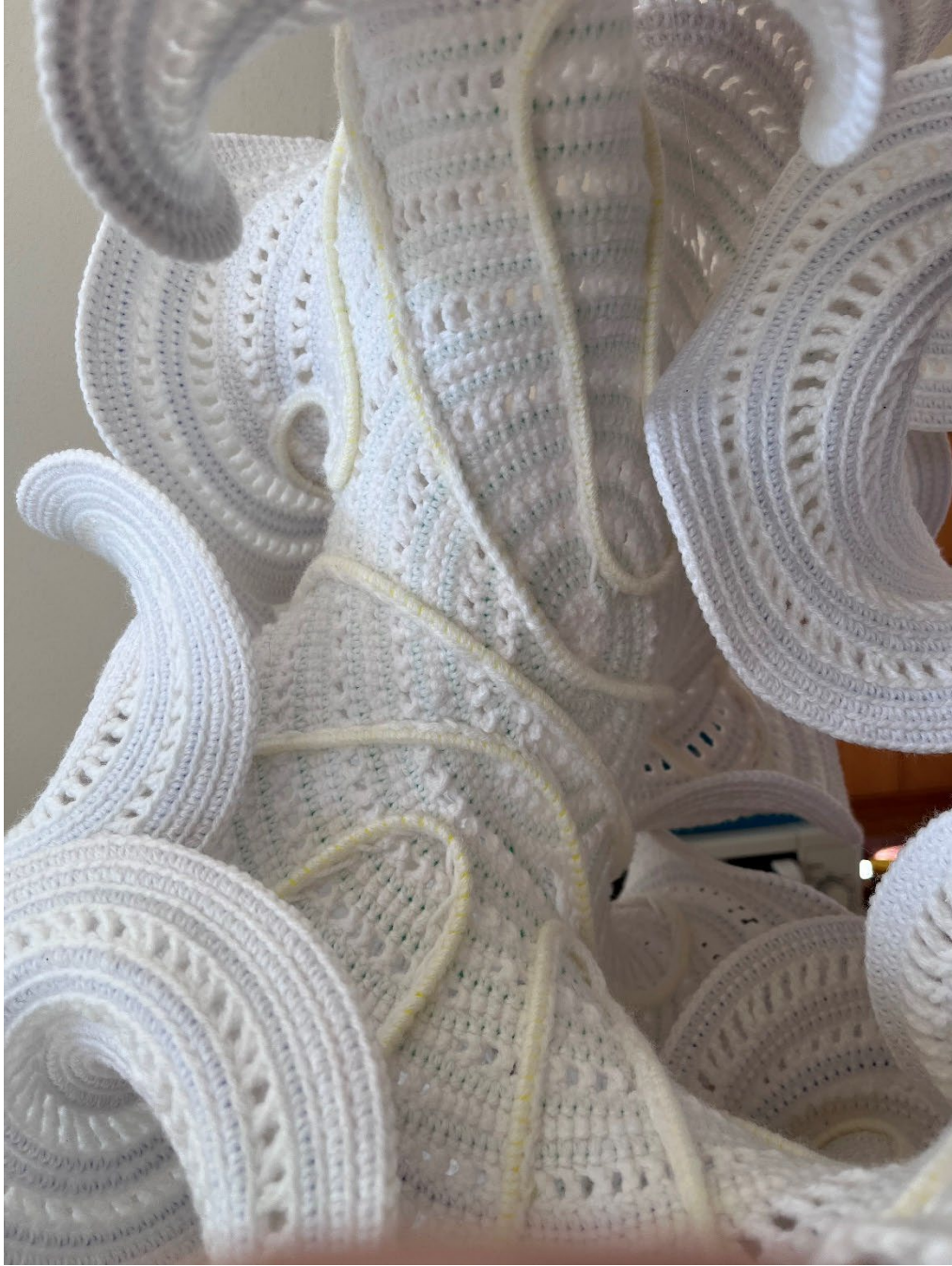
Rear detail of hyperbolic triangle with rib